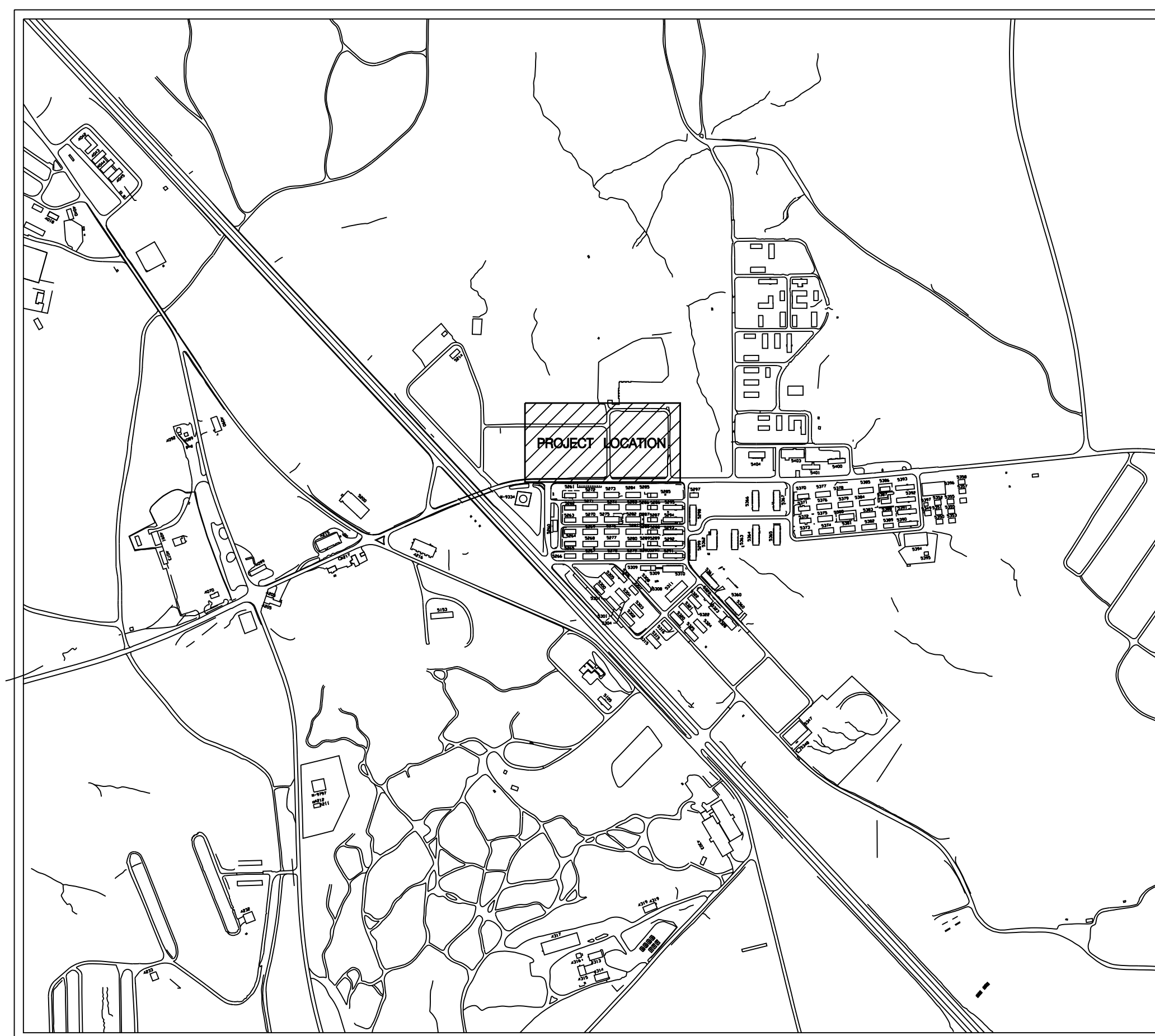
VICINITY MAP SCALE: NOT TO SCALE

FORT BENNING, GEORGIA CONTRACT NO. : W91236-09-C-0025